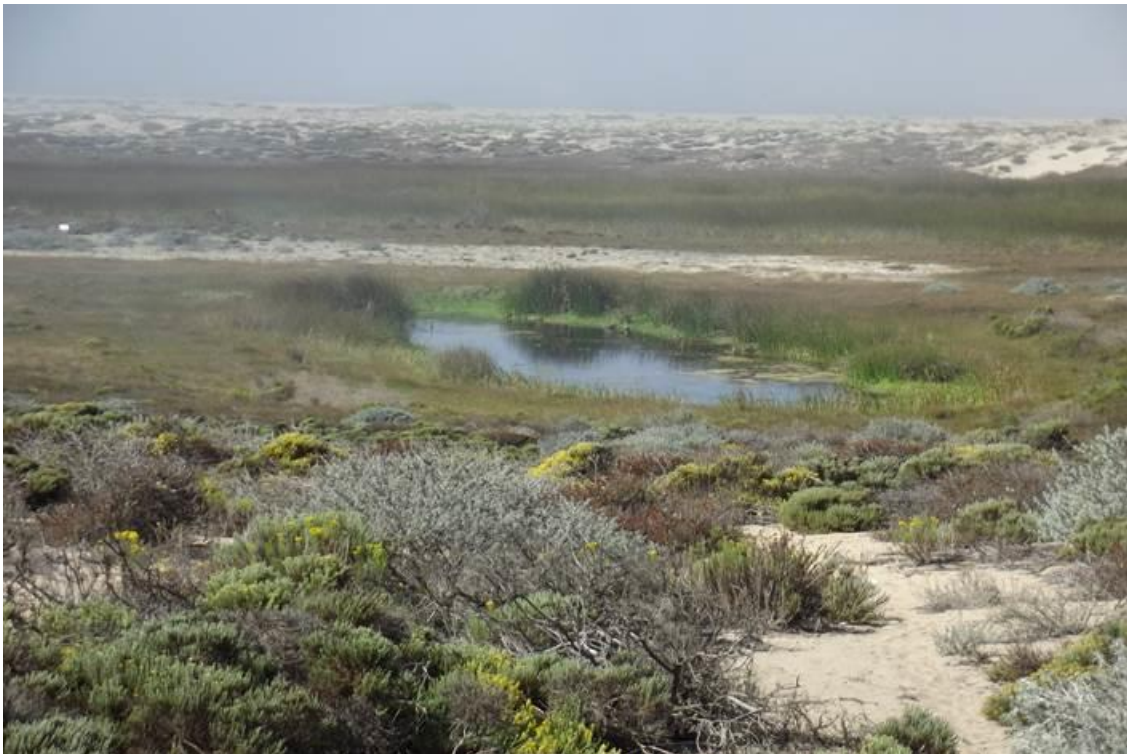
B1 Created wetland: one of several of the created wetlands adjacent to the Marsh Ponds.