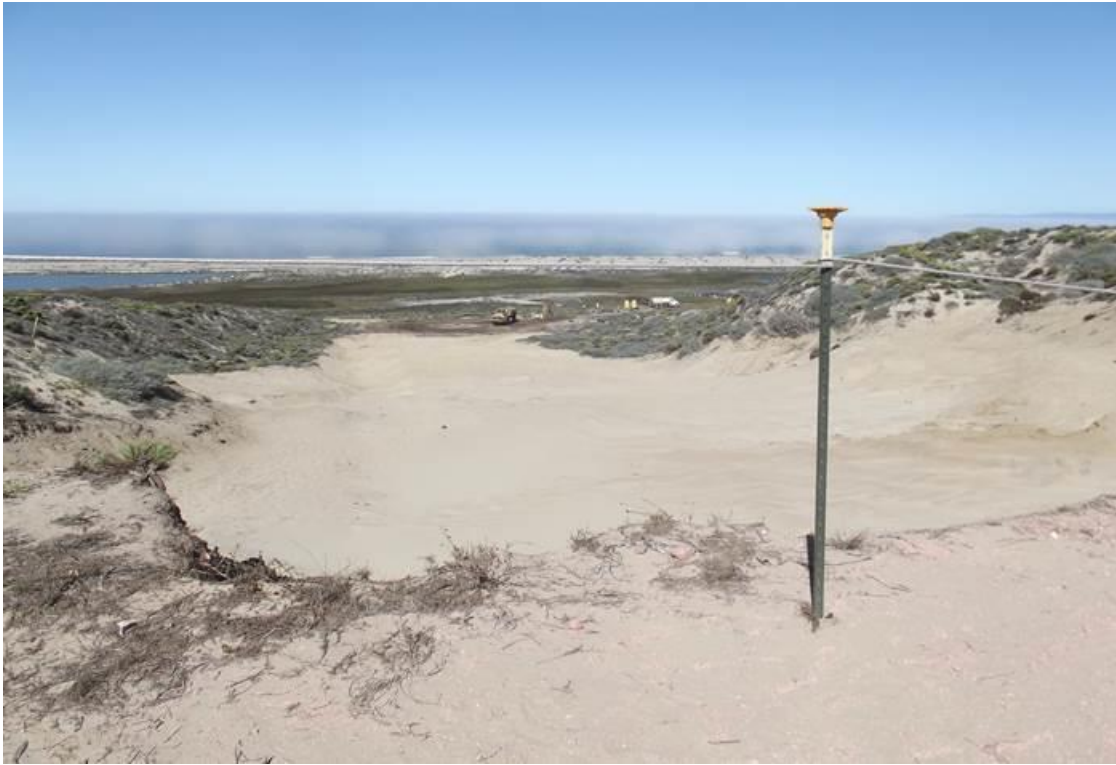
The D12 PROs Site: post-excitation: all of the diluent and sump material has been excavated; the site will be backfilled and recontoured and B&Ps will be installed.