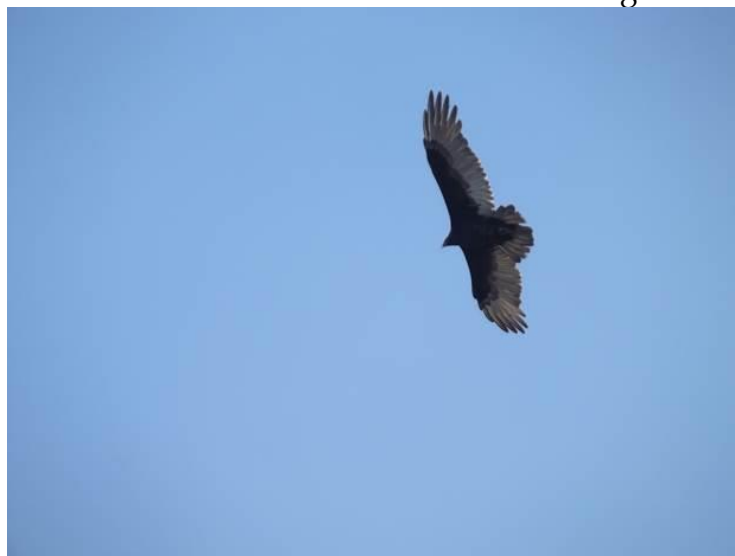
Turkey vulture overhead.