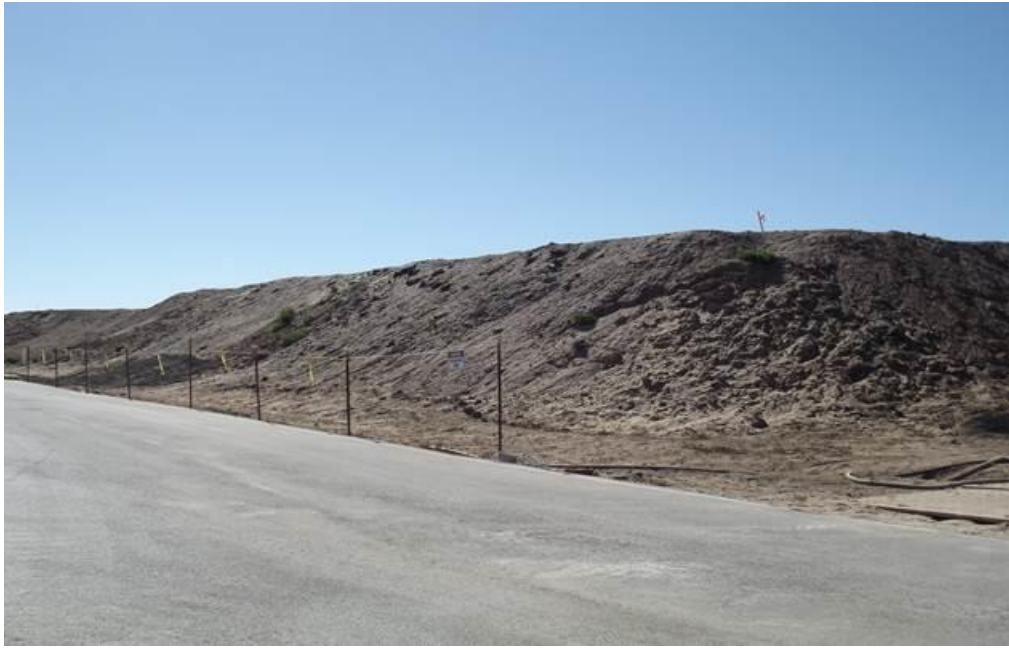
TB9 Stockpile Site: Chevron has ceased hauling additional material to this stockpile site, but has recontoured the stockpiled material and covered the entire pile with soil-sement in preparation of upcoming rainy season.