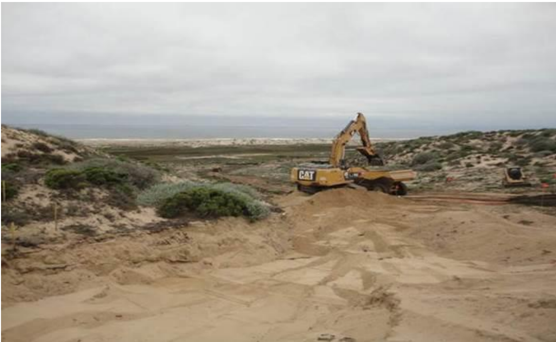
The D12 PROS Pad Site: excavation of sump and diluent-affected material.