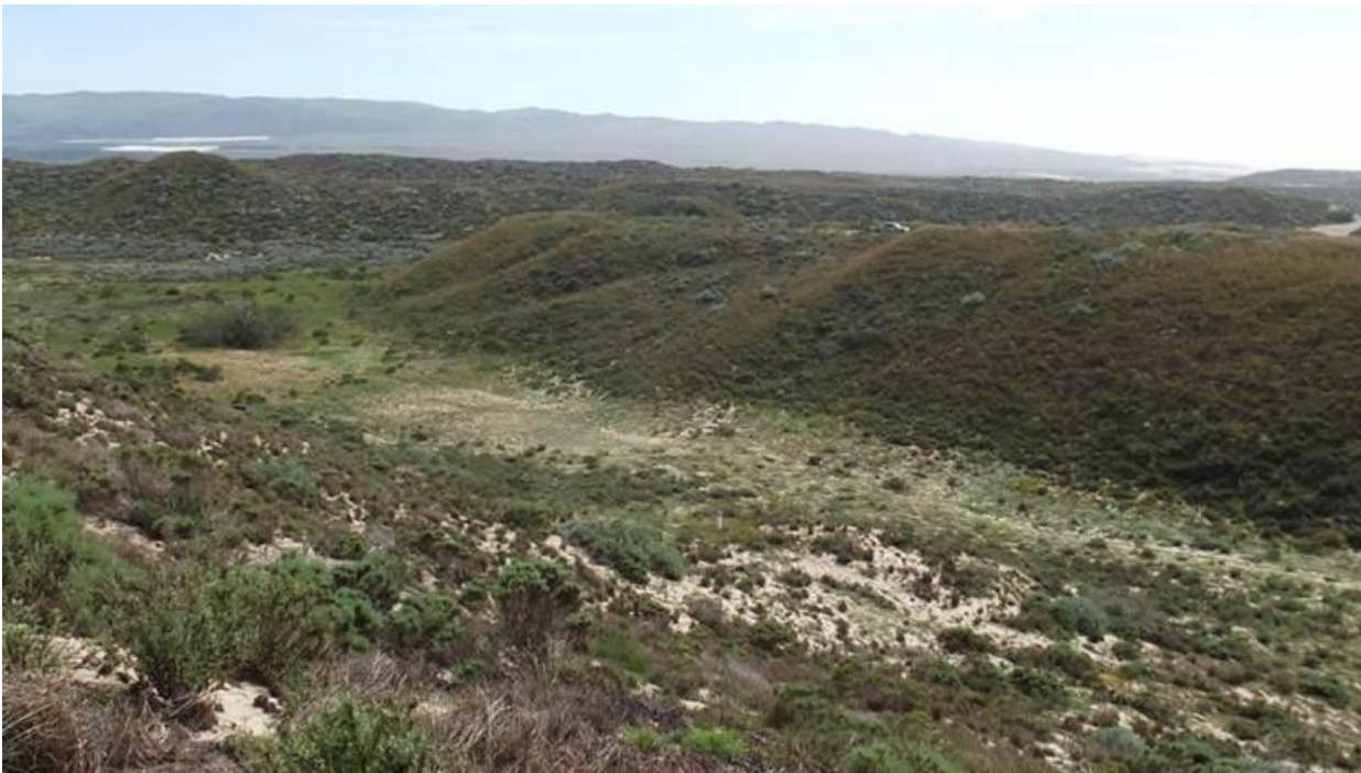
The M1 Valley: prior to remediation activities. The M1 wetland is located on the valley floor and far left portion of the photo. The excavation impacted approximately two-thirds of the valley floor.