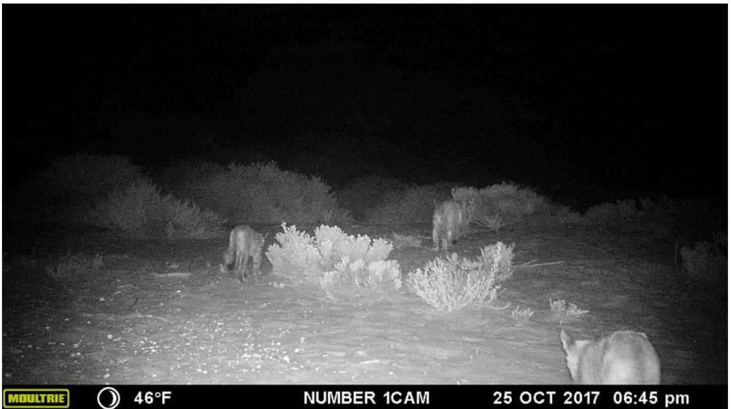
Three mountain lions, prowling. Caught on wildlife motion-detection camera set up at the P12 restoration site.