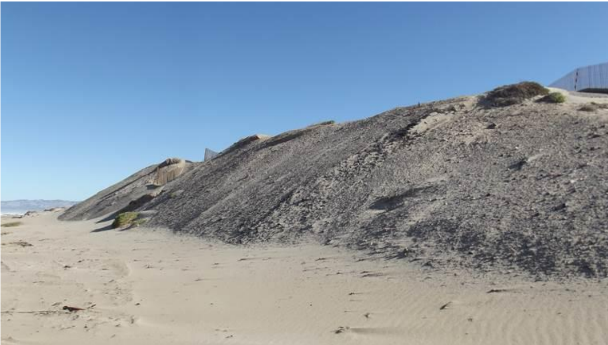
The 8X Pad Site: location of past sump excavations. The existing pad and road material is slowly eroding into ocean during high tides and winter storms.