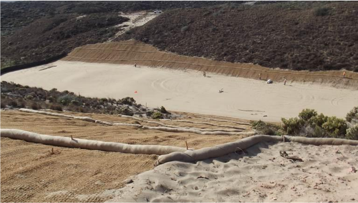
The M1 Valley: backfill along slopes has been completed, B&P measures are currently being installed including: placement of topsoil, jute-netting, sand fence, and application of hydroseed spray.