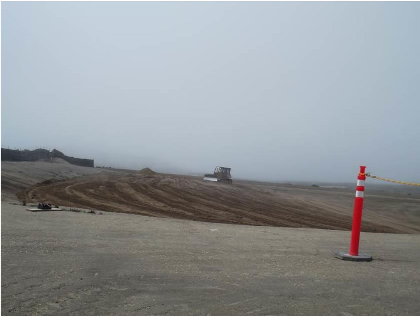
TB8 Stockpile Site: Chevron is currently using a portion of the TB8 Stockpile Site to stockpile excavated material.