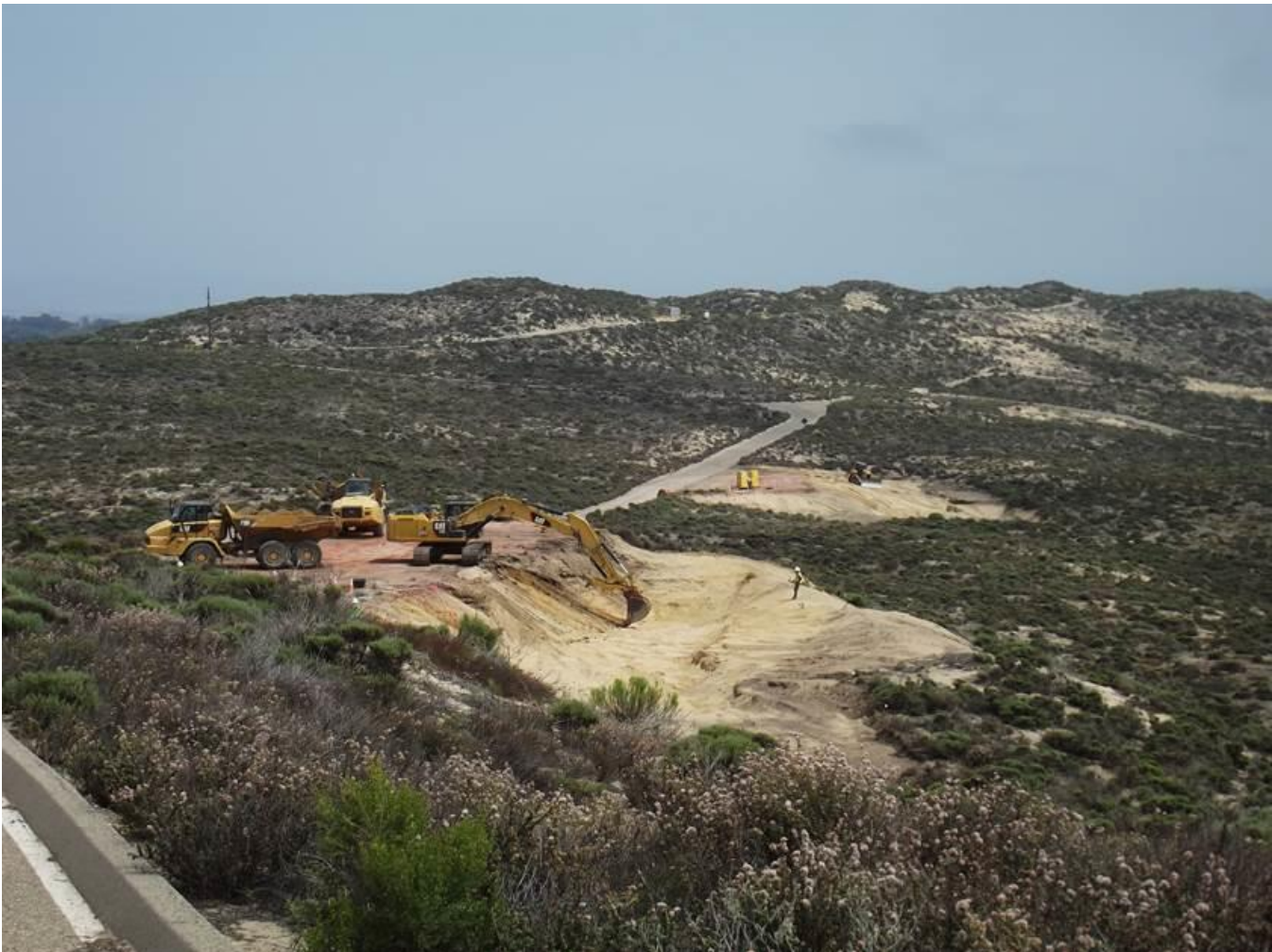
The F1 PROs Pad Site: excavation of sump continues; backfill is ongoing at G11 Pad site in the immediate background; past PROs treatment areas currently under restoration are visible in the far background.