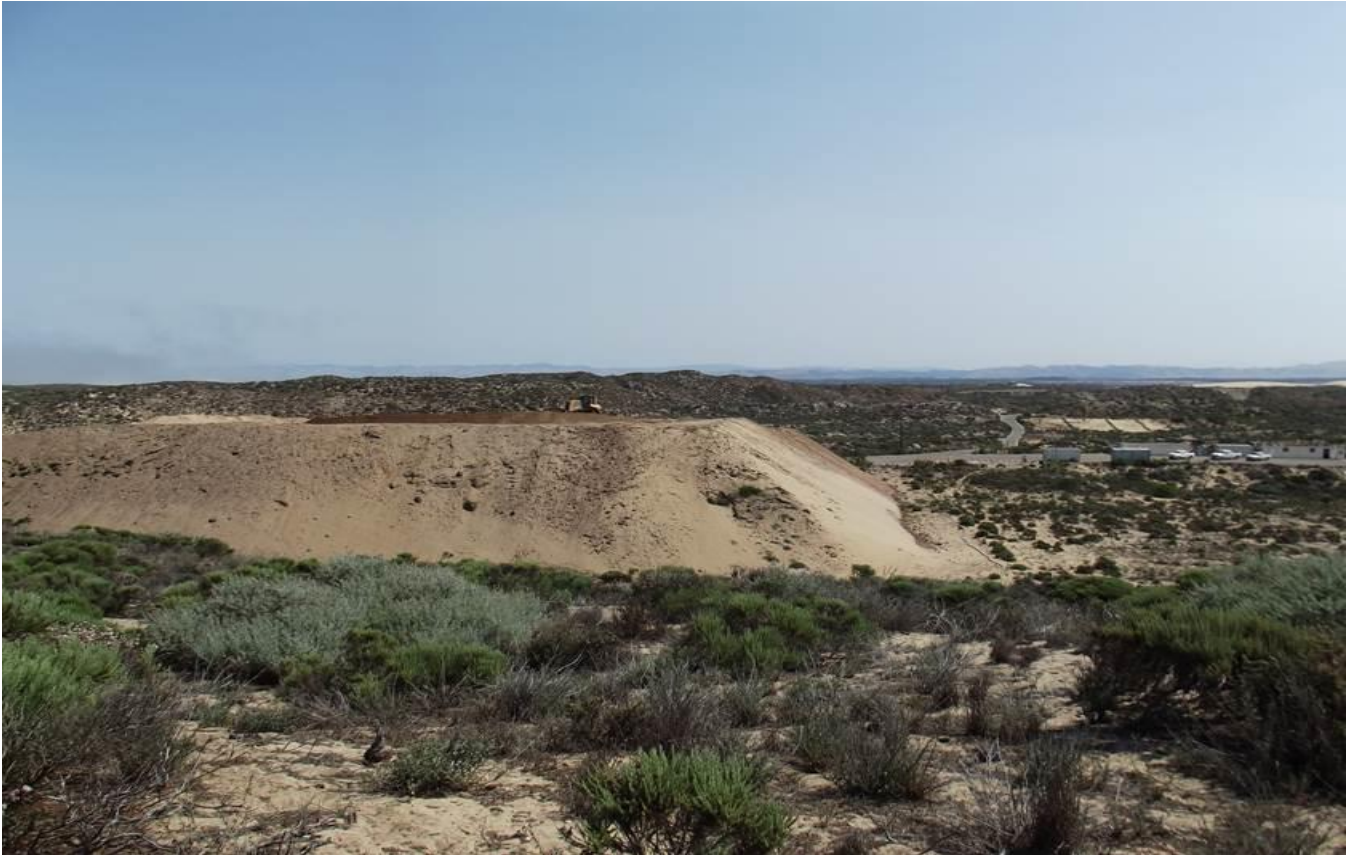
TB9 Stockpile Site: Chevron will temporarily cease hauling excavated material to this stockpile site. The existing stockpiled material will be graded and sealed with Soil Sement until the outcome of the future TB9 Landfill Feature has been determined.