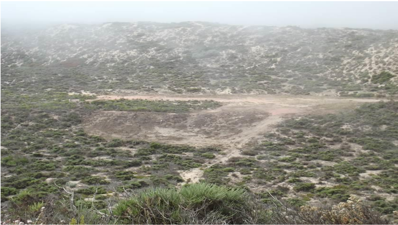
The E1 PROs Pad Site: vegetation has been removed from this site in preparation of future sump material excavation.