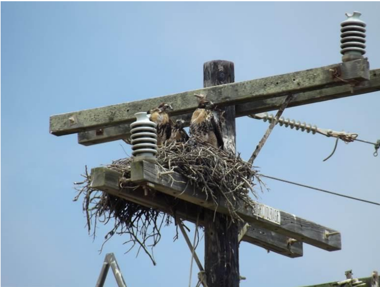
Red-tailed hawk nestlings in nest on power pole near the B Road.