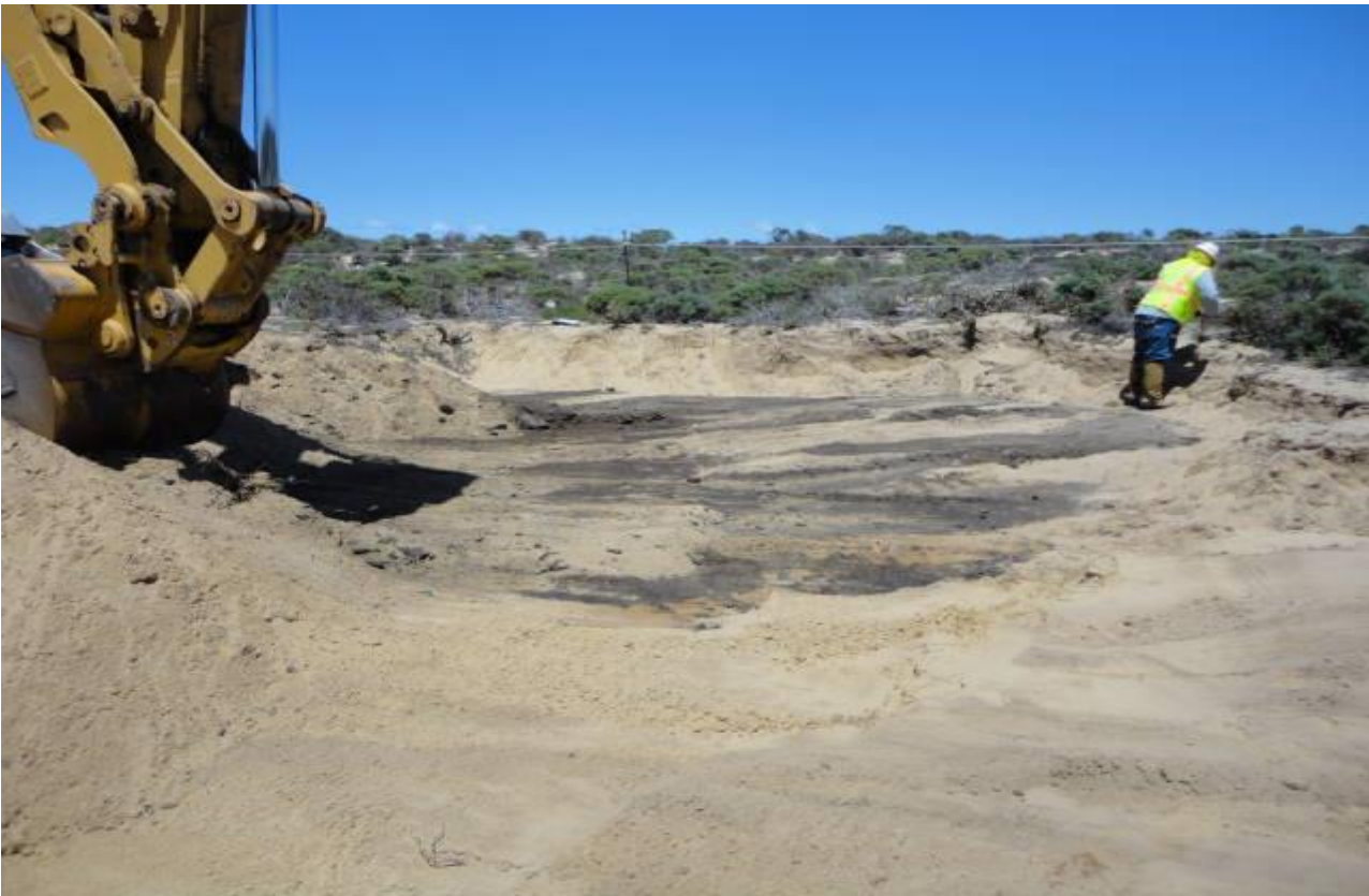
The H5 Sump: during excavation activities.