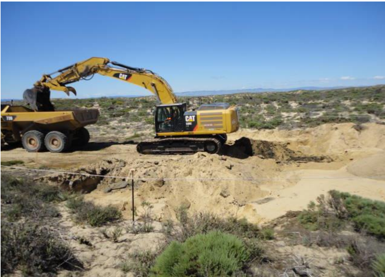
The H5 Sump: during excavation activities.