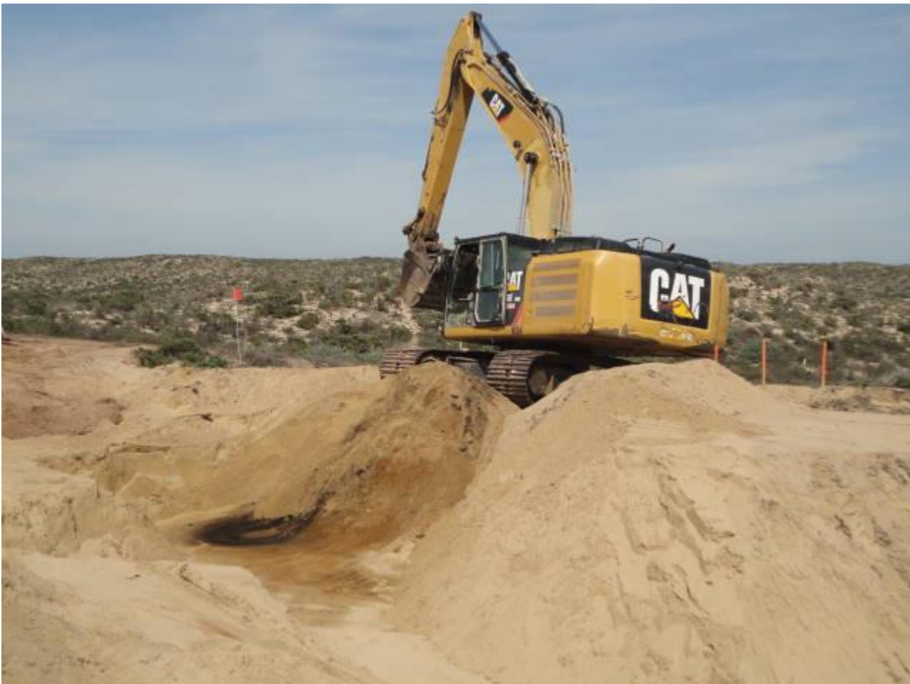
The I4 Site: during excavation activities. Diluent-contaminated soil and sump material was excavated from the pad site and pipeline route.