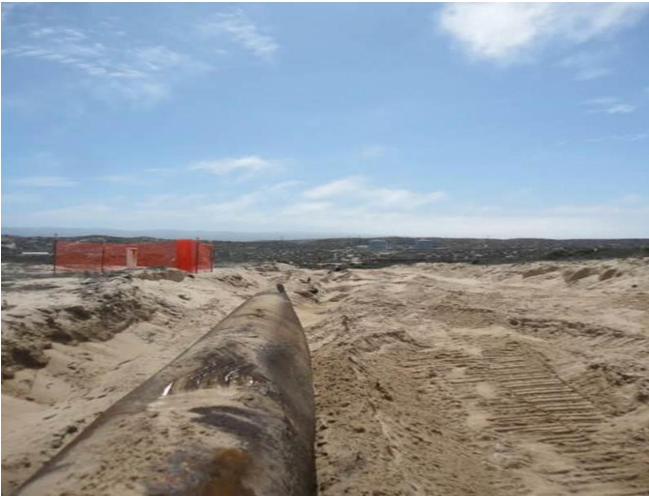
The I4 Site: removing 26-inch pipeline.