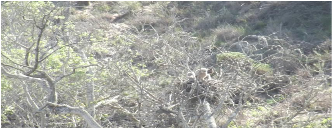
Great horned owl nestlings in cottonwood tree near the Q4 Borrow Site.