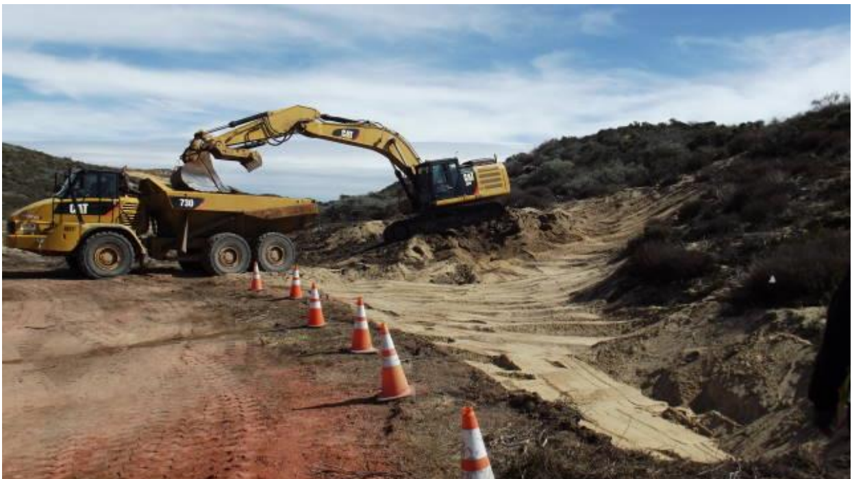
Excavating sump material at the G5 lower pad area.