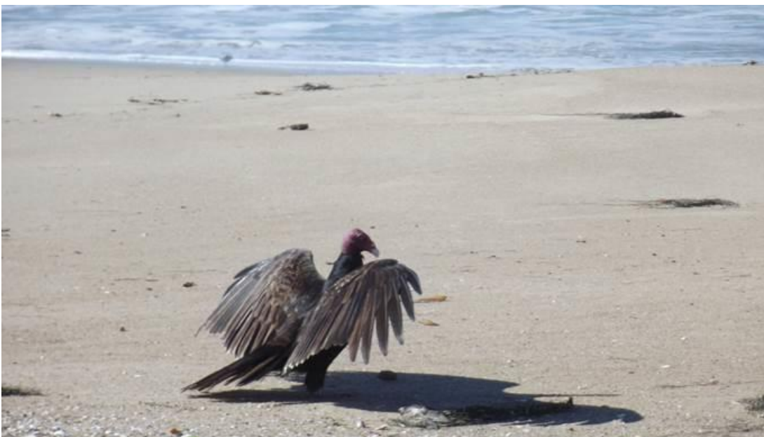
Turkey vulture sunning on beach.