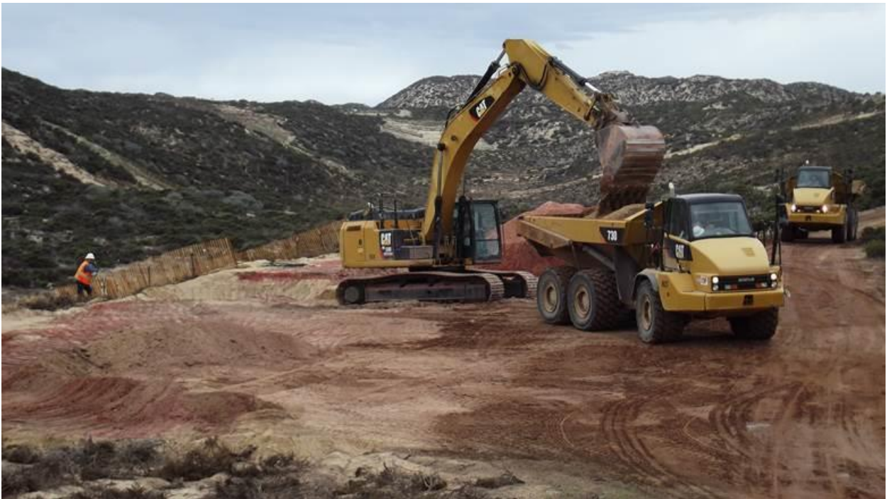
The I5 Site: during excavation activities. Diluent-contaminated soil and red rock was excavated from the pad site.