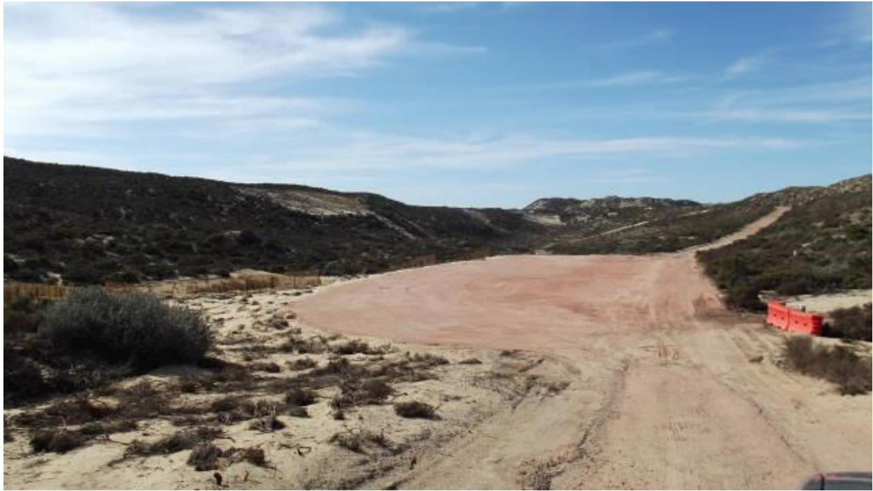
The I5 Site: post excavation activities: new red-rock was replaced and re-compacted to reconstruct red rock pad.