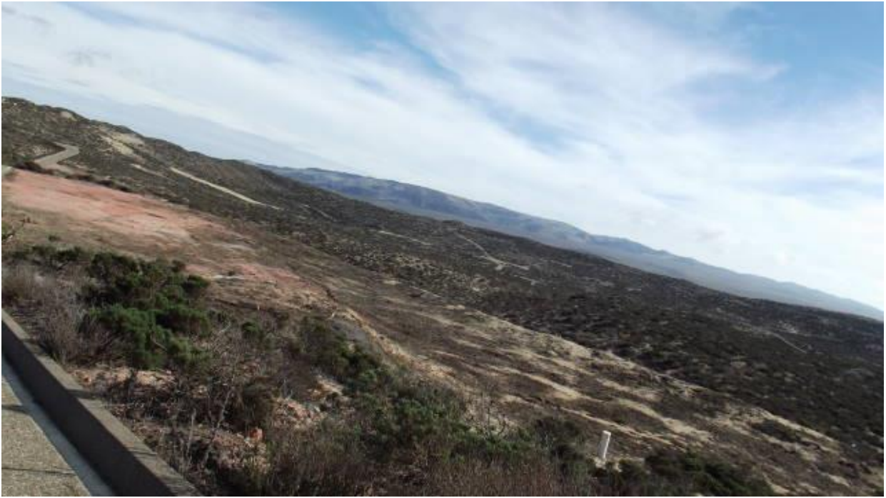
Vegetation removal at the F1 Pad for future sump removal.