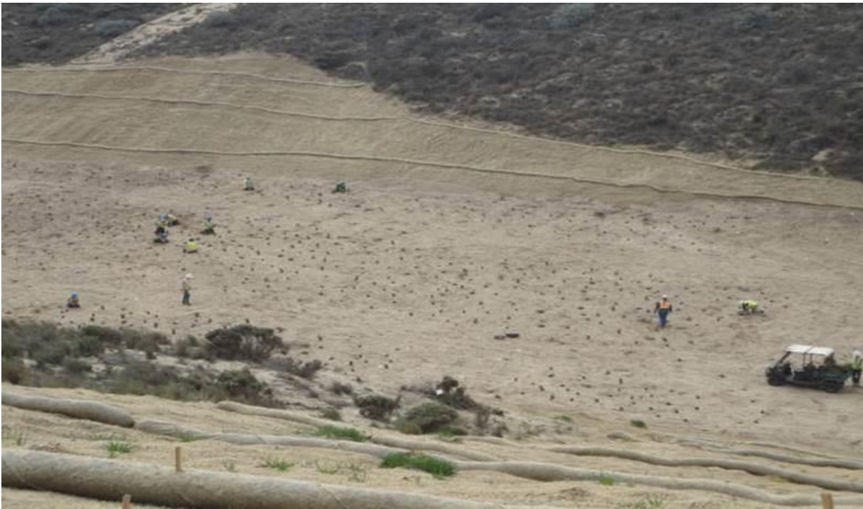
The M1 Valley: crews planting some of the 4,500 wetland plants in bottom of M1 Valley.