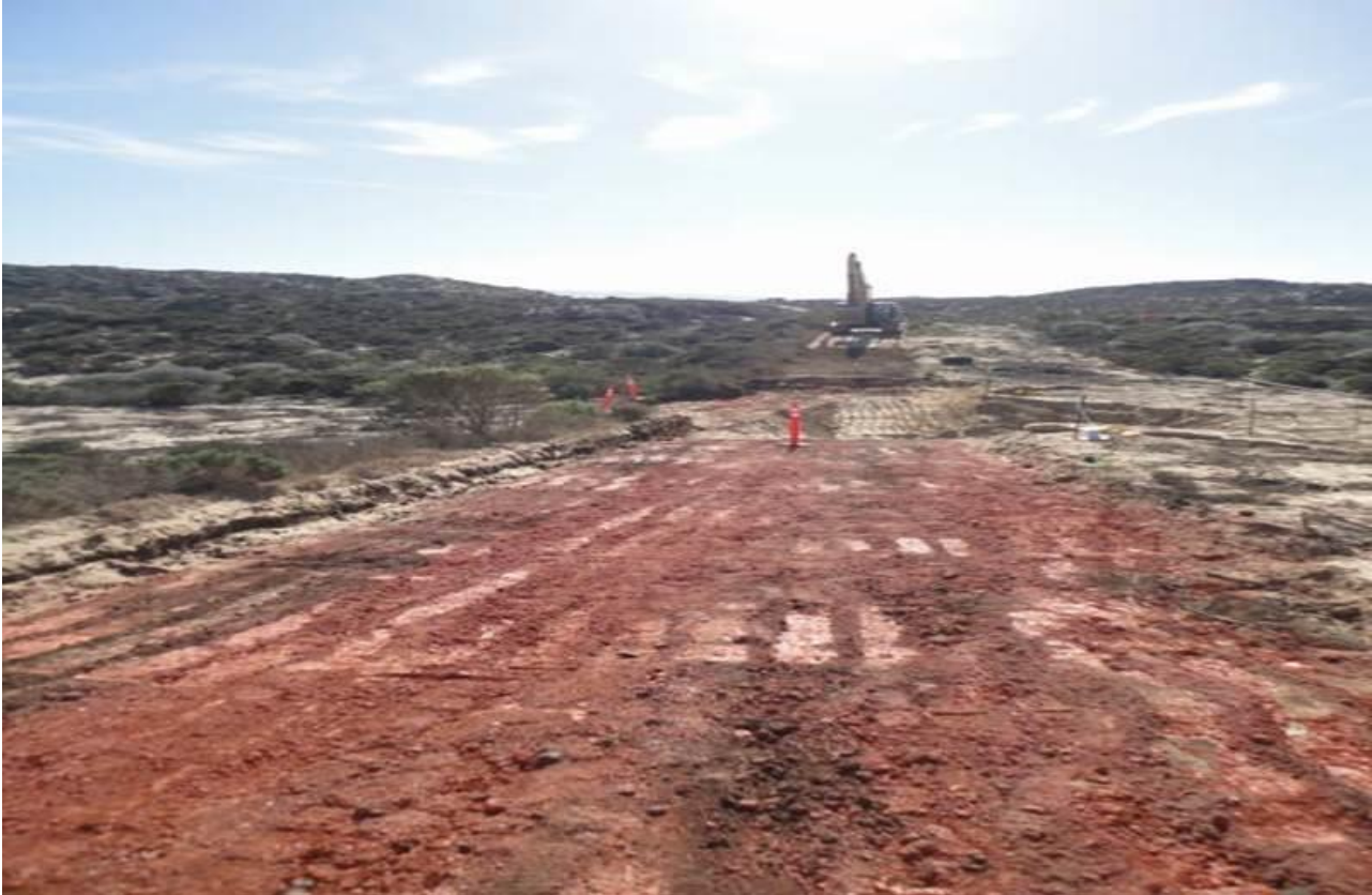
G5 Road: red rock removal and treatment.