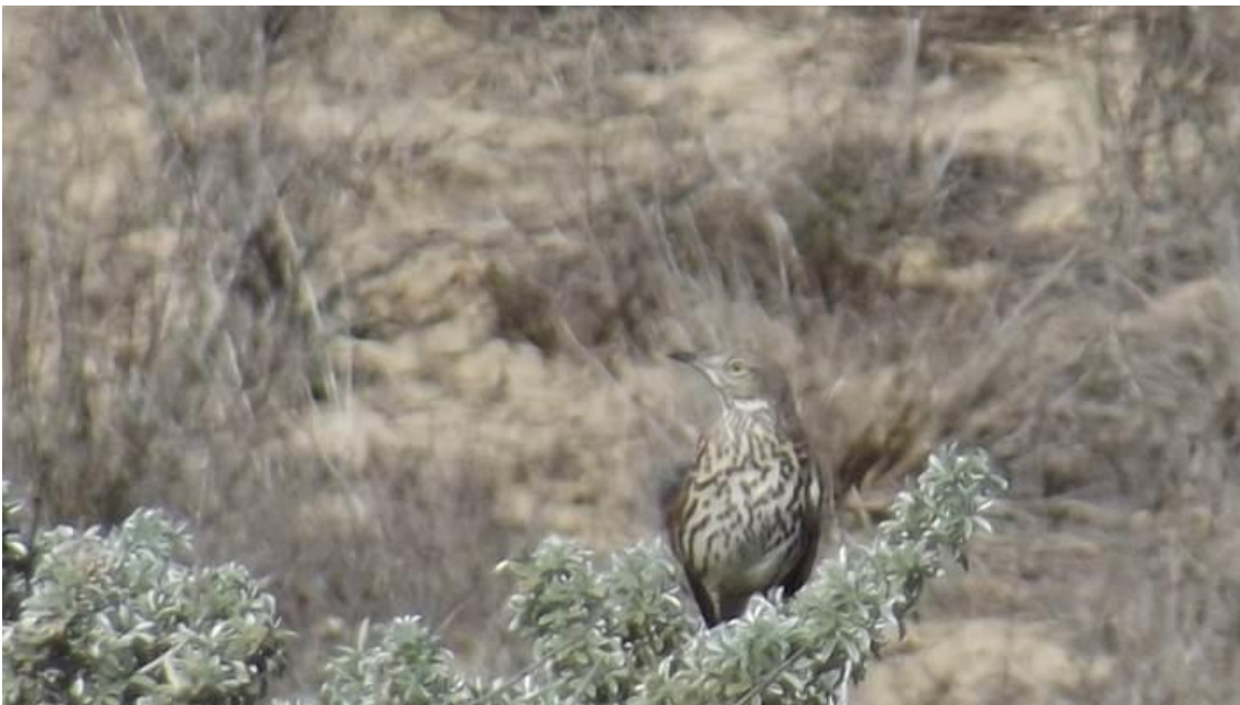
Sage thrasher (migrant) observed onsite in early February.